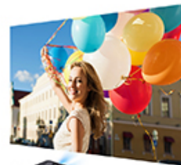
SuperColor™ projectors offer color accuracy levels

ViewSonic's exclusive SuperColor™ Technology delivers superior colour range than competitor projectors, ensuring that users enjoy more realistic and accurate colours. With an exclusive colour wheel design and dynamic lamp control capabilities, SuperColor™ Technology projects images with true-to-life colour performance in all scenarios, also reducing eye fatigue in bright and dark images.