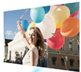
Conventional projectors offer low-quality images